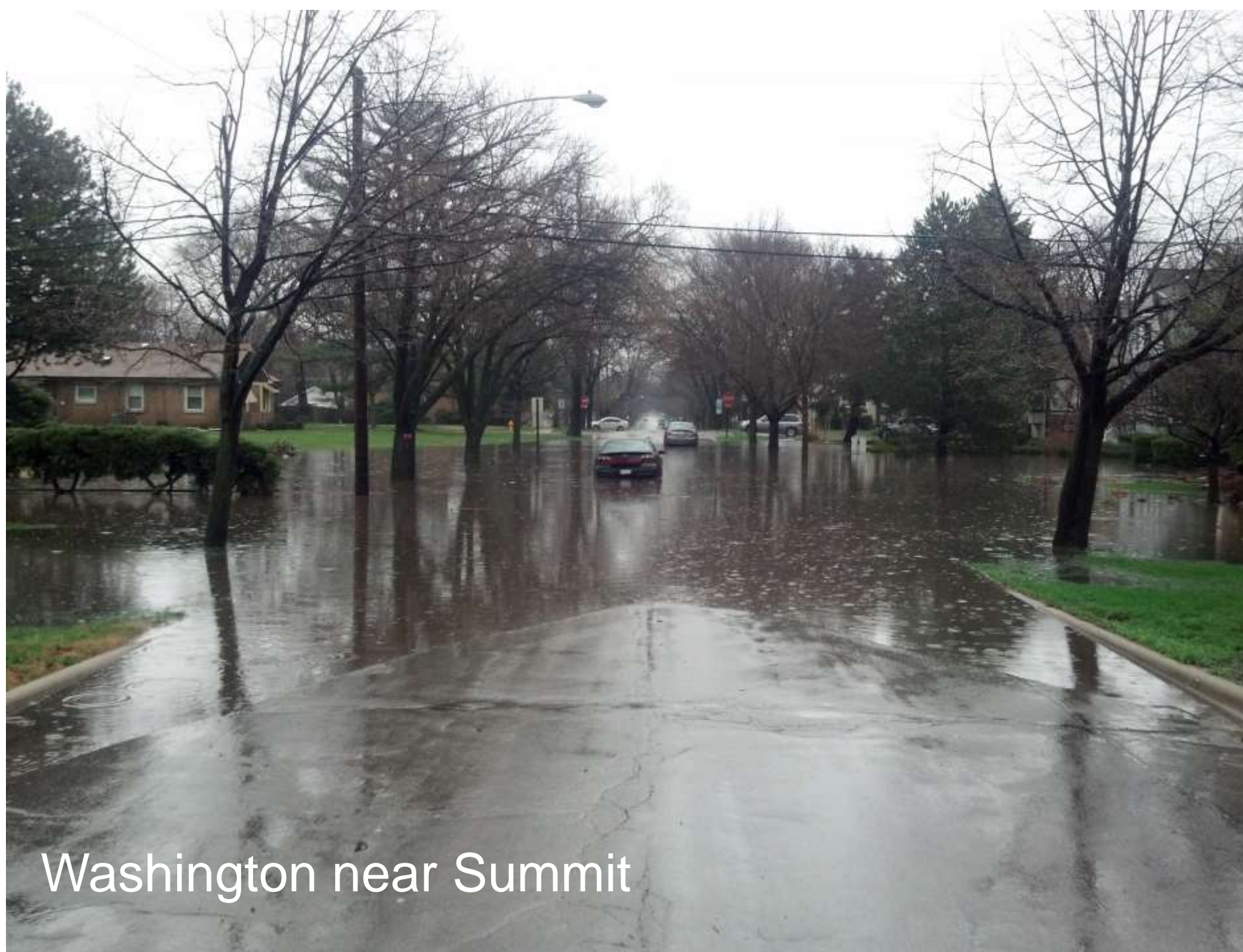
Washington near Summit