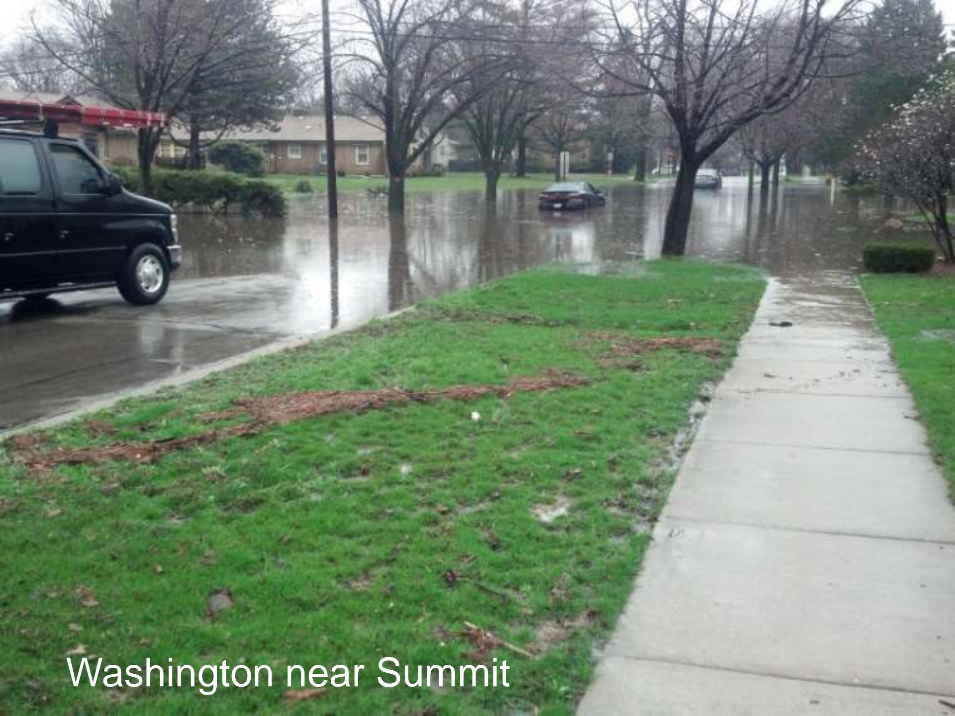
Washington near Summit