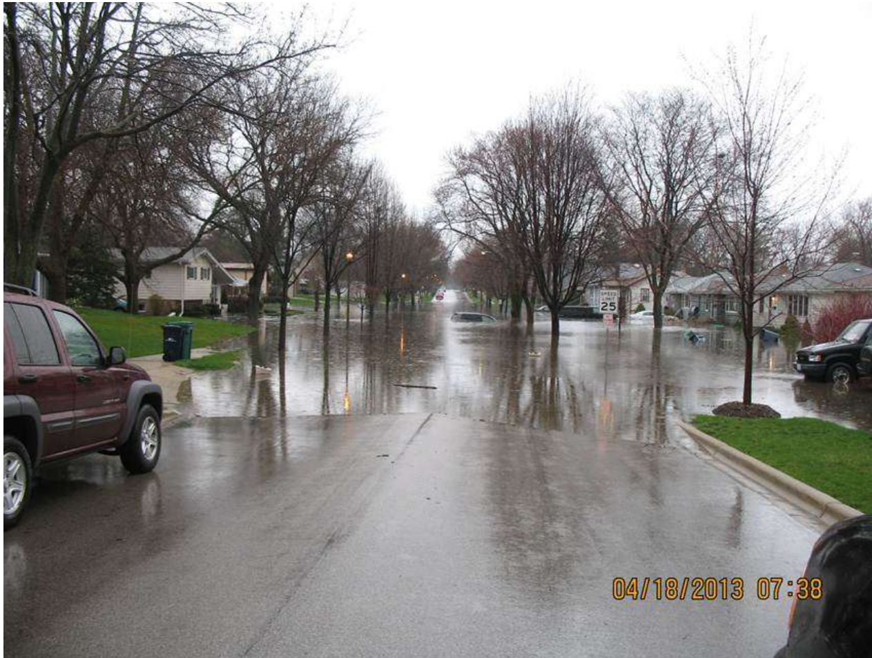
Photo of Addison St looking north from Madison St