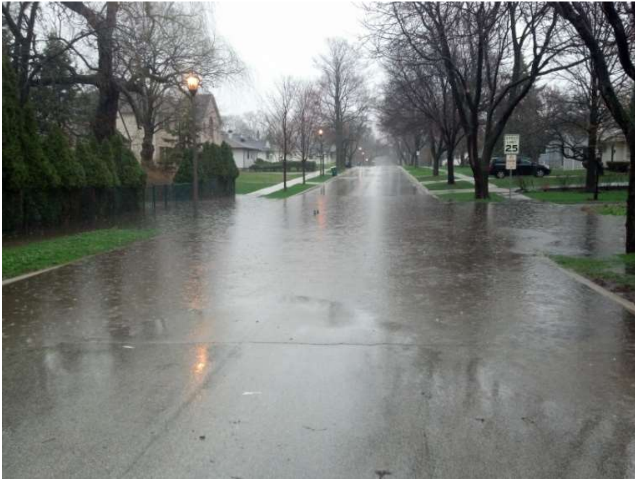
Photo of Addison St south of Washington St