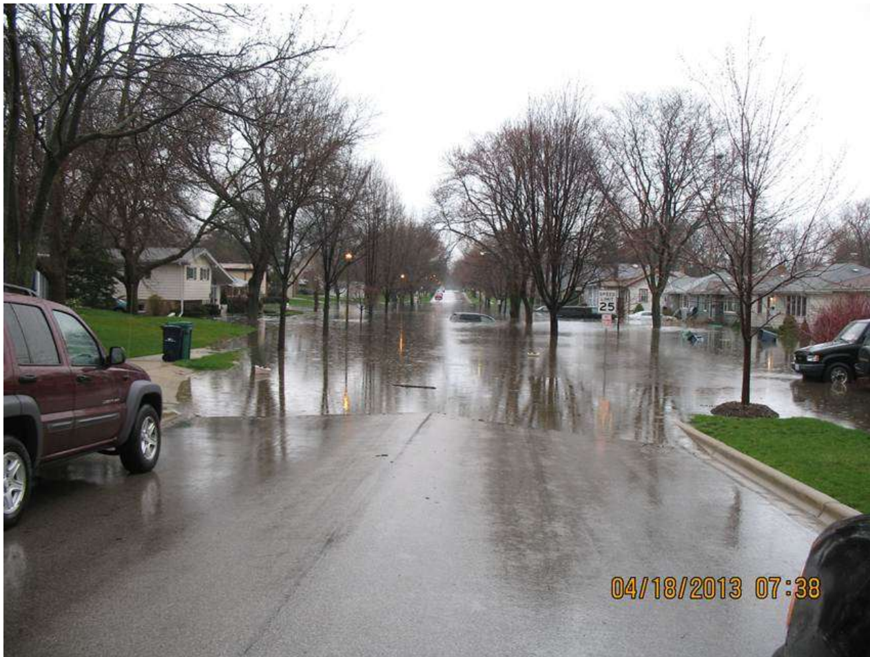
Photo of Addison St looking north from Madison St