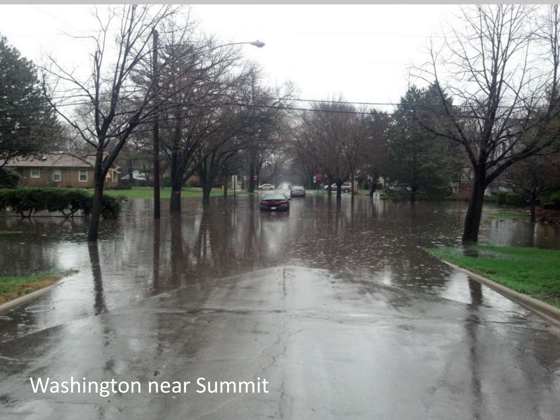
Washington near Summit