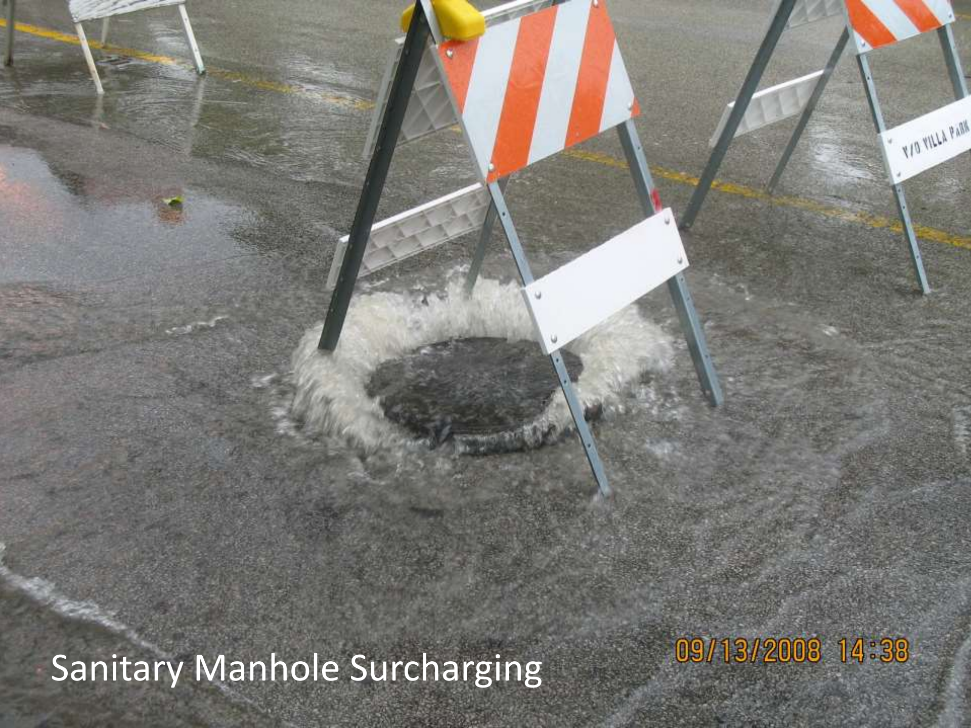
Sanitary Manhole Surcharging