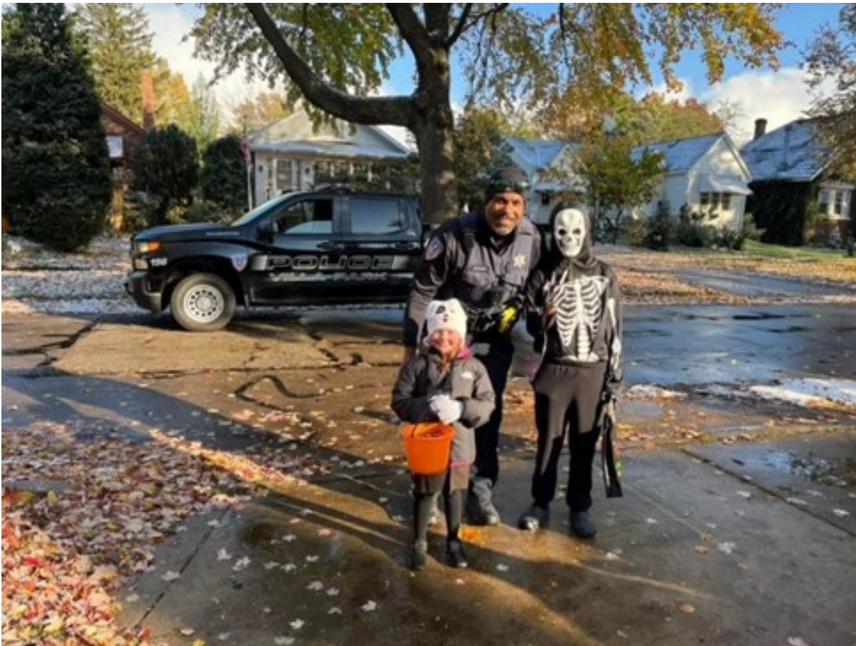
The Villa Park Police Department loves to participate in Halloween festivities.