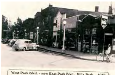
West Park Blvd. - now East Park Blvd., Villa Park - 1940