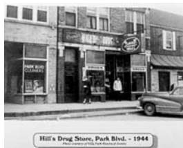
Hill's Drug Store, Park Blvd. - 1944