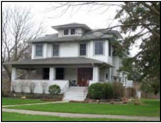
Sculley House – built 1910 333 E. Highland

American Foursquare with wide, sweeping front porch on a very large lot. It has many bay windows.