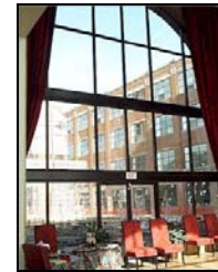
Former Ovaltine Building Arched Entrance – built 1928 1 Ovaltine Court

Its unique center hall connected four shops and may have been the first enclosed shopping "mall" in Illinois. During the 1920's and 30's, the A & P Grocery was its anchor. In the early 1940's, it was occupied by the Ben Franklin variety store.