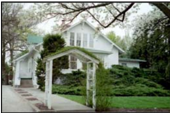
Limbach House – built 1916 405 E. Highland Avenue

Sears catalog mail order kit house - "Rodessa" model. This bungalow features a large stone fireplace on the addition to the right of the house.