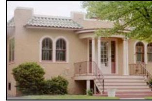
Emms House – built 1925 307 S. Monterey Avenue

English Tudor details include the steeply pitched roof and prominent chimney.