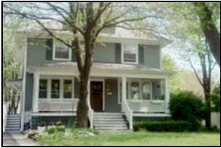
Morash House – built 1922 503 S. Summit Avenue

Villa Park's only log home; Craftsman influences include the low-pitched roof and overhanging eaves.