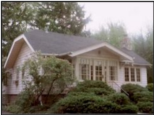
Hebenstreit House – built 1923 531 S. Euclid

American Foursquare details include hipped roof and full-width single story front porch.