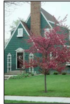
Steele House – built 1927 525 E. Highland Avenue

Vernacular farmhouse with Craftsman-style brackets on eaves.