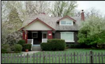
Reinbold House – built 1910 245 E. Highland Avenue

American Foursquare with wide, sweeping front porch on a very large lot. It has many bay windows.